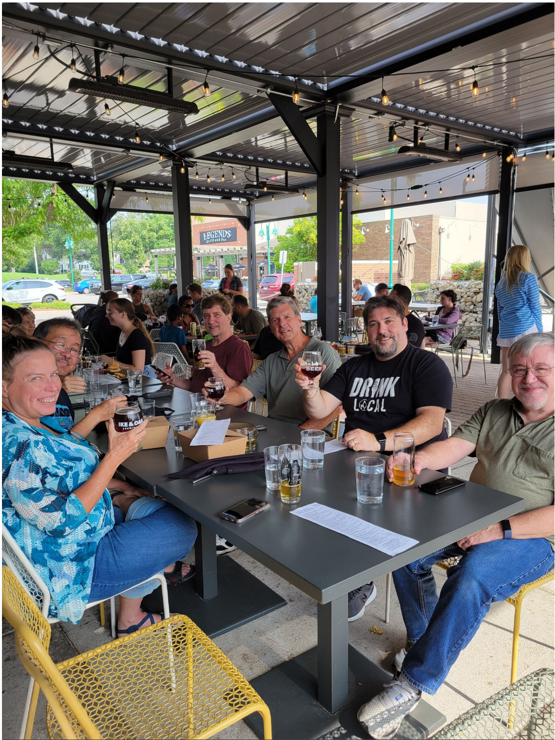
The club enjoying another Social Sunday afternoon at Ike & Oak Brewing in Woodridge on August 6th